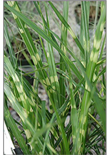
Porcupine Grass foliage

Porcupine Grass features bold plumes of rose flowers rising above the foliage in late summer. Its attractive grassy leaves are bluish-green in color with showy gold variegation. The foliage often turns yellow in fall. The silver seed heads are carried on showy plumes displayed in abundance from early fall to late winter. The brick red stems are very colorful and add to the overall interest of the plant.