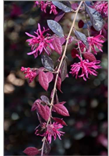
Purple Diamond Fringeflower flowers

Purple Diamond Fringeflower is recommended for the following landscape applications;