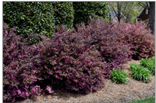
Purple Diamond Fringeflower in bloom