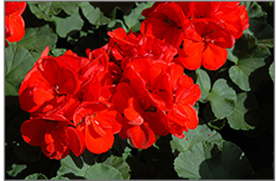
Patriot Red Geranium flowers

Patriot Red Geranium features bold balls of lightly-scented red flowers at the ends of the stems from late spring to early fall. The flowers are excellent for cutting. Its tomentose round palmate leaves remain green in color with prominent brown stripes throughout the year.