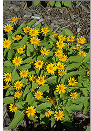
Million Gold Melampodium flowers