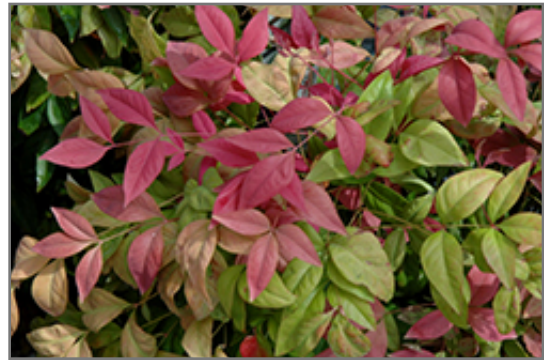
Blush Pink Nandina foliage

Blush Pink Nandina is recommended for the following landscape applications;