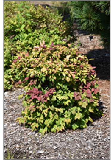
Blush Pink Nandina

Blush Pink Nandina makes a fine choice for the outdoor landscape, but it is also well-suited for use in outdoor pots and containers. It can be used either as 'filler' or as a 'thriller' in the 'spiller-thriller-filler' container combination, depending on the height and form of the other plants used in the container planting. It is even sizeable enough that it can be grown alone in a suitable container. Note that when grown in a container, it may not perform exactly as indicated on the tag - this is to be expected. Also note that when growing plants in outdoor containers and baskets, they may require more frequent waterings than they would in the yard or garden.