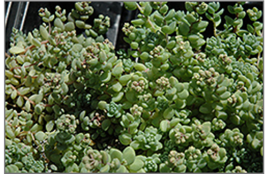
Corsican Stonecrop foliage

Corsican Stonecrop is recommended for the following landscape applications;