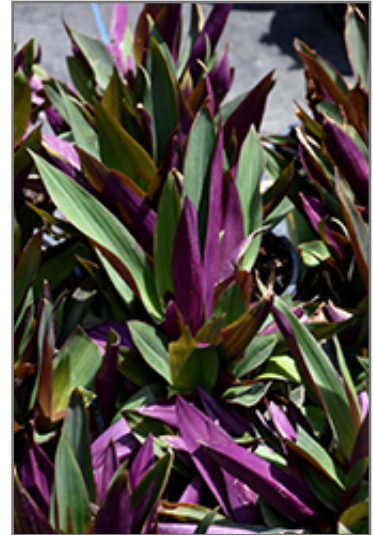
Moses In The Cradle foliage

Moses In The Cradle is recommended for the following landscape applications;