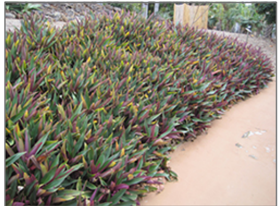
Moses In The Cradle