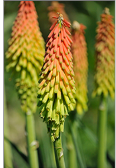
Fire Dance Torchlily flowers

Amazing red, orange, and bright yellow flower stalks rise from grassy, evergreen foliage in midsummer, creating a brilliant border or container planting; makes a great cutflower and attracts hummingbirds