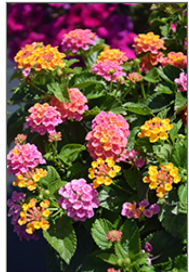
Bandana Rose Lantana flowers