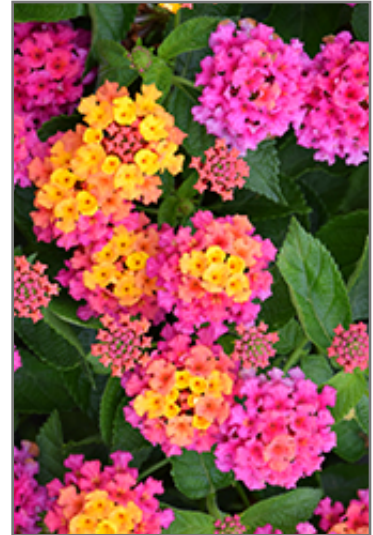
Bandana Rose Lantana flowers

Bandana Rose Lantana is recommended for the following landscape applications;