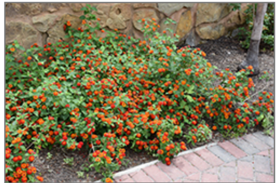
Dallas Red Lantana in bloom