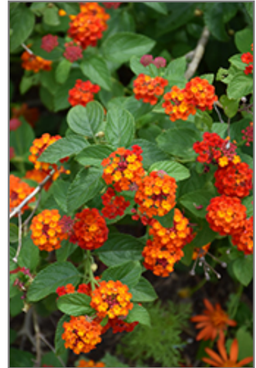
Dallas Red Lantana flowers