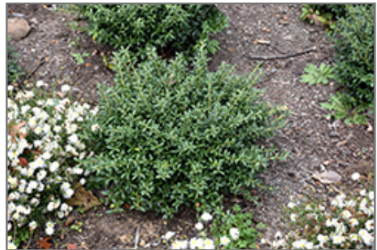
Soft Touch Japanese Holly