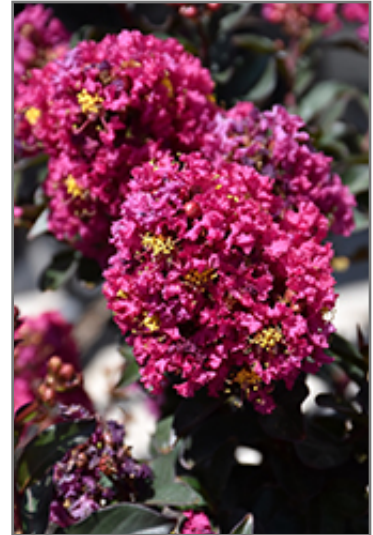
Plum Magic Crapemyrtle flowers