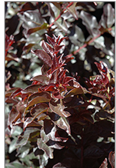
Plum Magic Crapemyrtle foliage