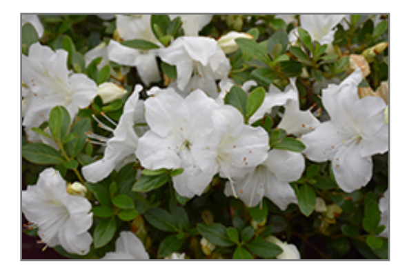
Encore Autumn Angel Azalea flowers

Encore Autumn Angel Azalea will grow to be about 5 feet tall at maturity, with a spread of 4 feet. It tends to be a little leggy, with a typical clearance of 1 foot from the ground, and is suitable for planting under power lines. It grows at a slow rate, and under ideal conditions can be expected to live for 40 years or more.