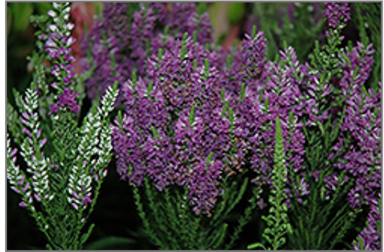
Purple Explosion Speedwell flowers