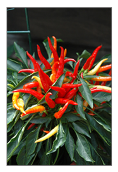
Medusa Ornamental Pepper fruit

Medusa Ornamental Pepper is an herbaceous annual with an upright spreading habit of growth. Its medium texture blends into the garden, but can always be balanced by a couple of finer or coarser plants for an effective composition.