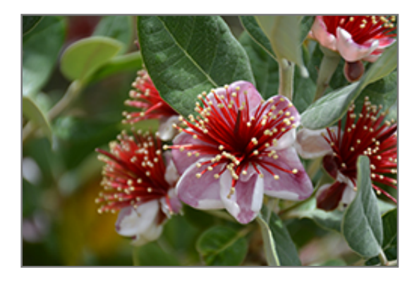
Pineapple Guava flowers

Pineapple Guava features showy white pincushion flowers with pink overtones and red anthers at the ends of the branches from late spring to early summer. It has dark green foliage with gray undersides which emerges light green in spring. The fuzzy oval pinnately compound leaves remain dark green throughout the winter. The fruits are showy green drupes carried in abundance from early summer to mid fall.