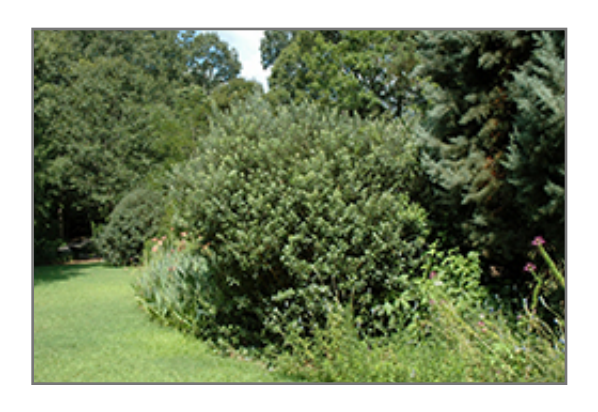
Pineapple Guava