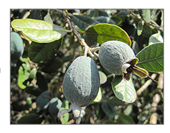
Pineapple Guava fruit

Pineapple Guava is a good choice for the edible garden, but it is also well-suited for use in outdoor pots and containers. Its large size and upright habit of growth lend it for use as a solitary accent, or in a composition surrounded by smaller plants around the base and those that spill over the edges. It is even sizeable enough that it can be grown alone in a suitable container. Note that when grown in a container, it may not perform exactly as indicated on the tag - this is to be expected. Also note that when growing plants in outdoor containers and baskets, they may require more frequent waterings than they would in the yard or garden.