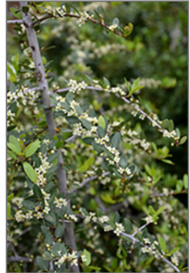
Weeping Yaupon Holly flowers

Weeping Yaupon Holly makes a fine choice for the outdoor landscape, but it is also well-suited for use in outdoor pots and containers. Because of its height, it is often used as a 'thriller' in the 'spiller-thriller-filler' container combination; plant it near the center of the pot, surrounded by smaller plants and those that spill over the edges. It is even sizeable enough that it can be grown alone in a suitable container. Note that when grown in a container, it may not perform exactly as indicated on the tag - this is to be expected. Also note that when growing plants in outdoor containers and baskets, they may require more frequent waterings than they would in the yard or garden.