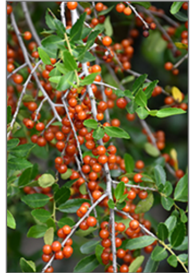
Weeping Yaupon Holly fruit