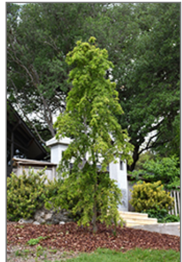
Weeping Yaupon Holly