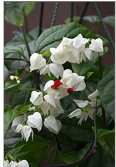
Bleeding Heart Vine flowers