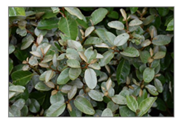
Ebbing's Silverberry foliage