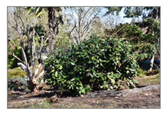
Ebbing's Silverberry