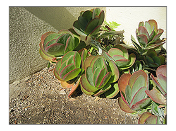
Flapjacks Kalanchoe

Flapjacks Kalanchoe is an herbaceous evergreen perennial with a mounded form. Its medium texture blends into the garden, but can always be balanced by a couple of finer or coarser plants for an effective composition.