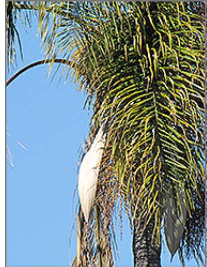
Queen Palm flowers

Queen Palm is a fine choice for the yard, but it is also a good selection for planting in outdoor pots and containers. Because of its height, it is often used as a 'thriller' in the 'spiller-thriller-filler' container combination; plant it near the center of the pot, surrounded by smaller plants and those that spill over the edges. It is even sizeable enough that it can be grown alone in a suitable container. Note that when grown in a container, it may not perform exactly as indicated on the tag - this is to be expected. Also note that when growing plants in outdoor containers and baskets, they may require more frequent waterings than they would in the yard or garden.