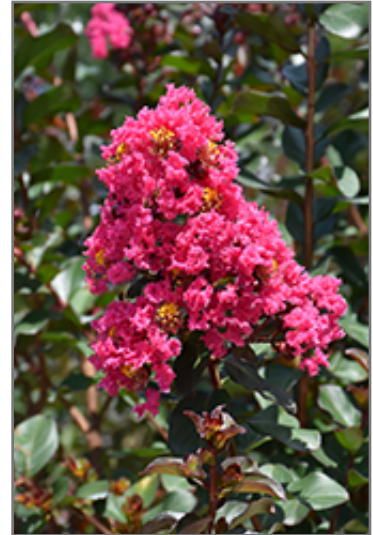
Pink Velour Crapemyrtle flowers