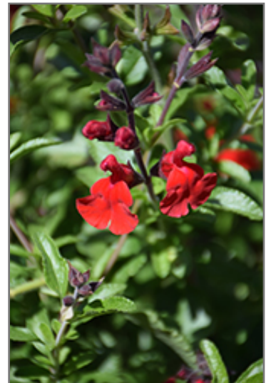
Radio Red Autumn Sage flowers