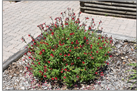
Radio Red Autumn Sage in bloom