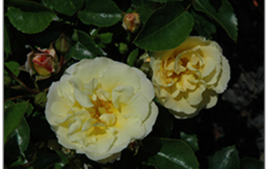
Popcorn Drift Rose flowers

Popcorn Drift Rose is blanketed in stunning creamy white flowers with buttery yellow overtones at the ends of the branches from late spring to early fall, which emerge from distinctive yellow flower buds. The flowers are excellent for cutting. It has dark green deciduous foliage. The glossy oval compound leaves do not develop any appreciable fall color.