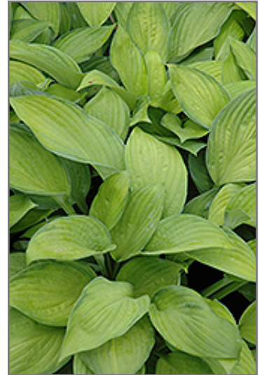
Gold Standard Hosta foliage