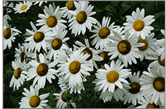
Alaska Shasta Daisy flowers

Alaska Shasta Daisy has masses of beautiful white daisy flowers with yellow eyes at the ends of the stems from early to late summer, which are most effective when planted in groupings. The flowers are excellent for cutting. Its serrated narrow leaves remain dark green in color throughout the season.