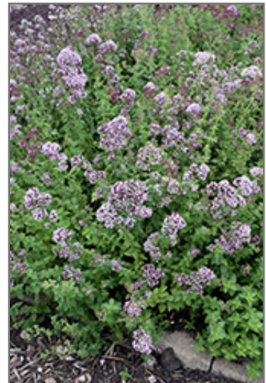
Oregano flowers