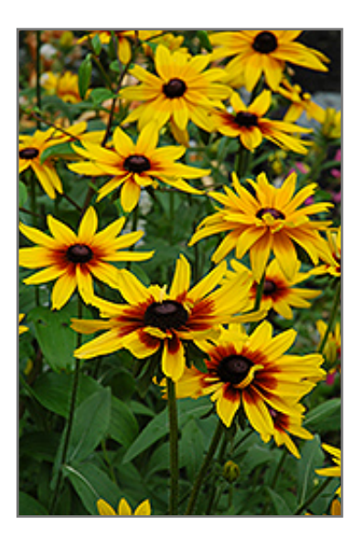
Becky Coneflower flowers