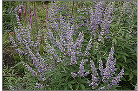
Chaste Tree flowers