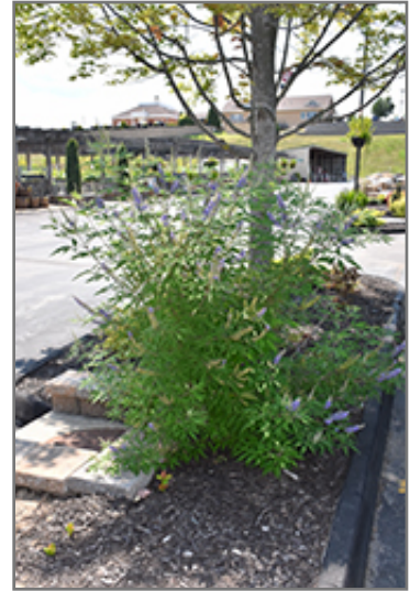
Chaste Tree in bloom

This shrub does best in full sun to partial shade. It is very adaptable to both dry and moist locations, and should do just fine under average home landscape conditions. It is considered to be drought-tolerant, and thus makes an ideal choice for xeriscaping or the moisture-conserving landscape. It is not particular as to soil type or pH, and is able to handle environmental salt. It is highly tolerant of urban pollution and will even thrive in inner city environments, and will benefit from being planted in a relatively sheltered location. This species is not originally from North America.