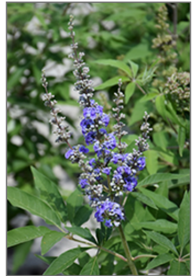
Chaste Tree flowers