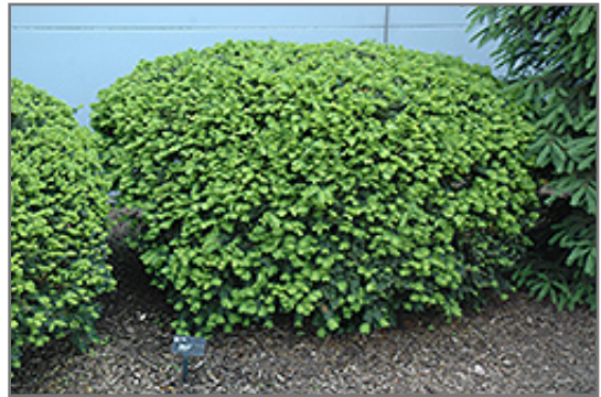
Densiformis Yew