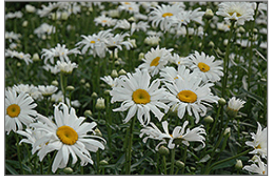
Shasta Daisy flowers