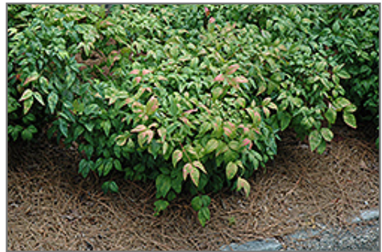
Fire Power Nandina