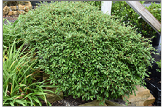
Scarlet Leader Willowleaf Cotoneaster

This shrub will require occasional maintenance and upkeep, and should not require much pruning, except when necessary, such as to remove dieback. It is a good choice for attracting birds to your yard, but is not particularly attractive to deer who tend to leave it alone in favor of tastier treats. Gardeners should be aware of the following characteristic(s) that may warrant special consideration;