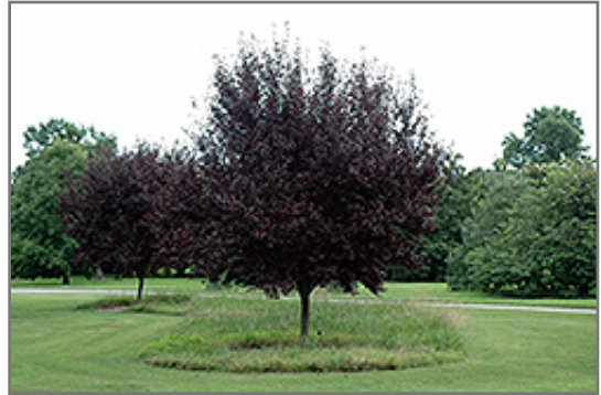
Krauter Vesuvius Plum

This tree should only be grown in full sunlight. It does best in average to evenly moist conditions, but will not tolerate standing water. It is not particular as to soil type or pH. It is highly tolerant of urban pollution and will even thrive in inner city environments. This is a selected variety of a species not originally from North America.