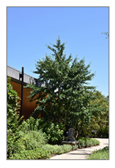
Autumn Gold Ginkgo