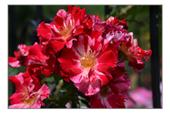
Fourth of July Rose flowers

This woody vine will require occasional maintenance and upkeep, and is best pruned in late winter once the threat of extreme cold has passed. It is a good choice for attracting bees to your yard. It has no significant negative characteristics.