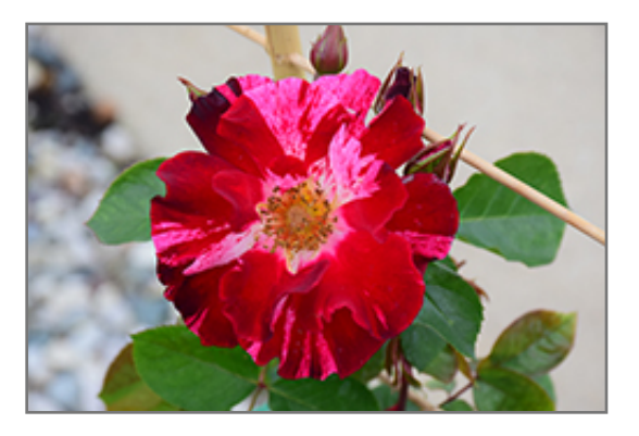
Fourth of July Rose flowers

Fourth of July Rose will grow to be about 12 feet tall at maturity, with a spread of 3 feet. As a climbing rose, it can be leggy near the base and may be concealed by underplanting with lower-growing facer plants. It should be planted near a fence, trellis or other landscape structure where it can be trained to grow upwards on it, or allowed to trail off a retaining wall or slope. It grows at a fast rate, and under ideal conditions can be expected to live for approximately 30 years.