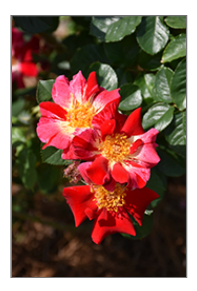
Fourth of July Rose flowers

The Home & Garden Center 4513 W Loop 281 Longview, Texas 75604 (903) 753-2223