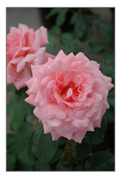
Sexy Rexy Rose flowers