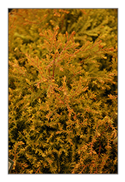
Fire Chief Arborvitae foliage

The Home & Garden Center 4513 W Loop 281 Longview, Texas 75604 (903) 753-2223