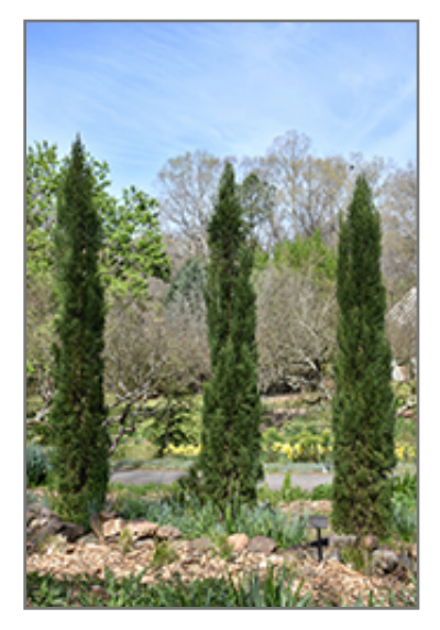
Blue Italian Cypress