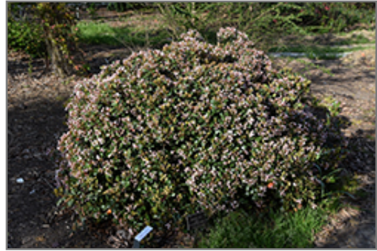
Eleanor Taber Indian Hawthorn in bloom