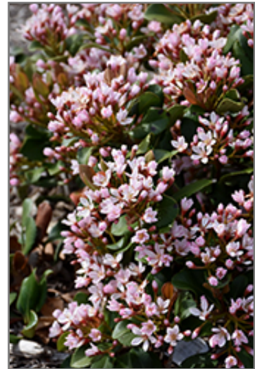
Eleanor Taber Indian Hawthorn flowers